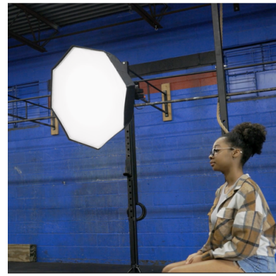
Full Video Production Internship (Interviewing, Narrative Assembly, Recording, Editing, Music Creation)