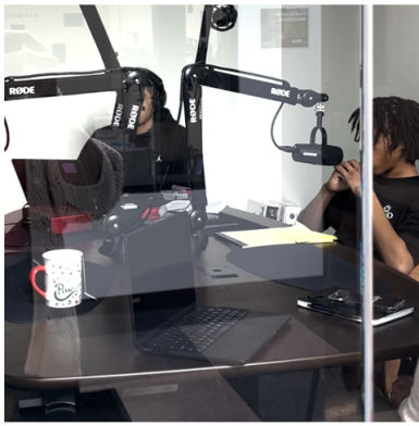
Full Podcast Internship (Interviewing, Editing, Logo and Channel Creation)